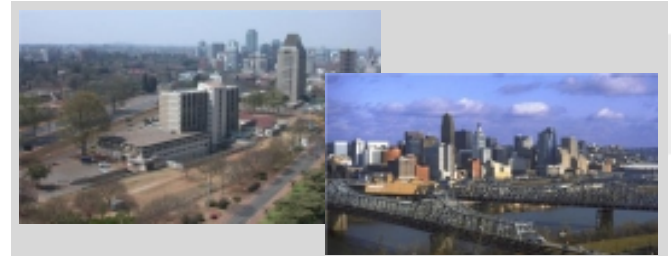
Sister Cities – Harare on the left and Cincinnati