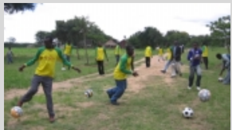
Boys playing with soccer ball gifts