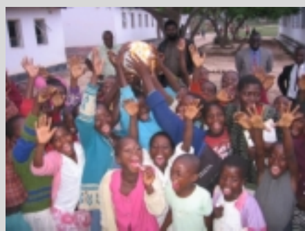
Girls playing with soccer ball gifts

And yet, I must say, in my thirty years of serving the Lord, I have never experienced God's gracious hand so evident upon us during our recent trip to Zimbabwe.