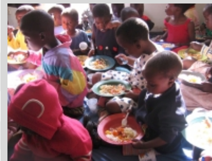
Children eating some of over 2,000 meals we provided

gave away 500 pounds of candy and 40 brand new soccer balls and many toys and thousand of books and pieces of Christian literature.