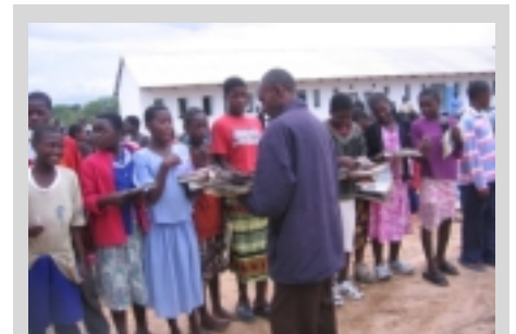
Gospel literature we distributed