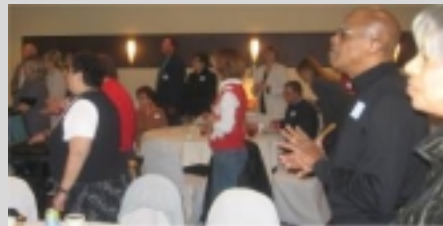
GO Church Banquet, November 14