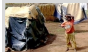
Another child awaits help

(You can mail your donation or give on-line at www.uttermost.org .)